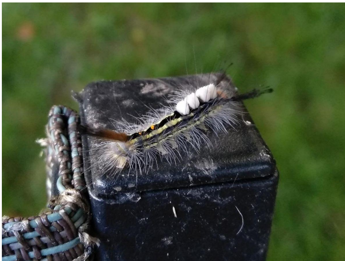
A white marked tussock moth caterpillar hanging out on a patio chair. It took me a few minutes to figure out which end was the head! Couldn't help but marvel at this little guy.

All sorts of things that make up the mundane, suddenly made awesome (and dare I say holy?). The rush of gratitude surprises me, takes the air out of my lungs as if there was suddenly less space in my chest. In hundreds of these moments, of seeing the "small" things, God has caused me to worship.