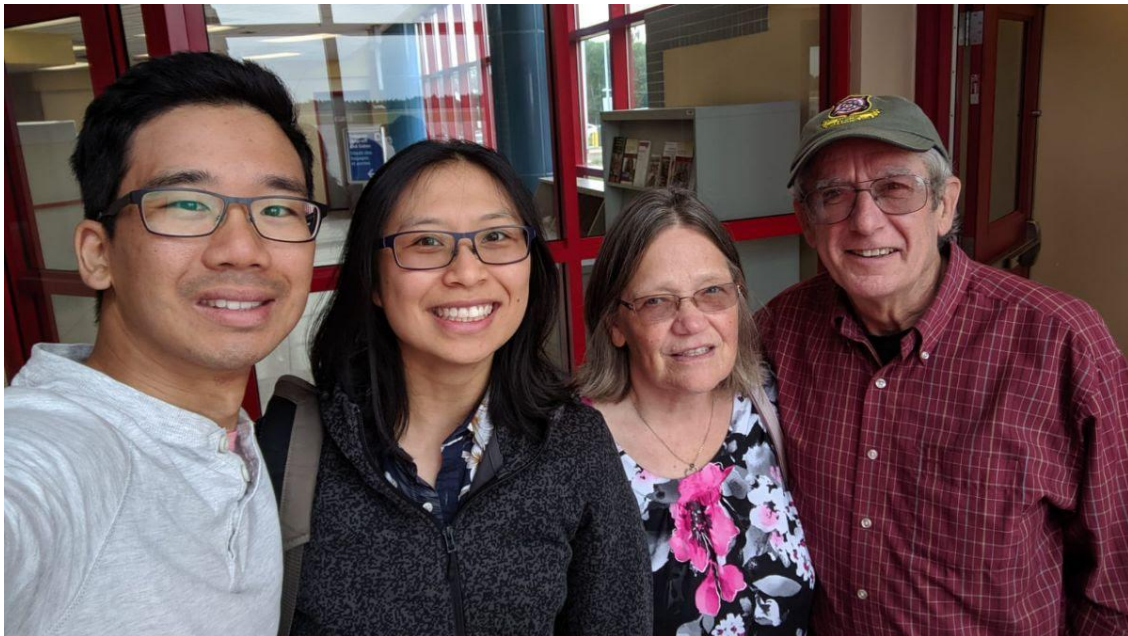
Our lovely friends, sending us off at the Saint John airport.