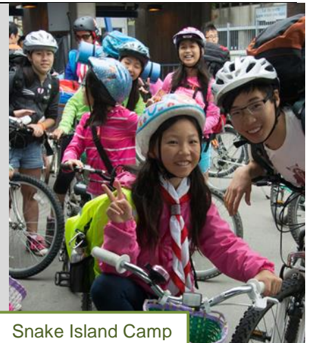
Snake Island Camp