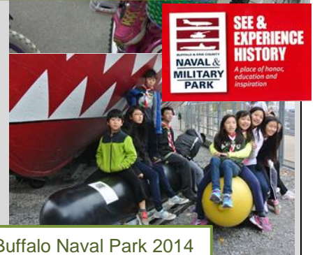
Buffalo Naval Park 2014